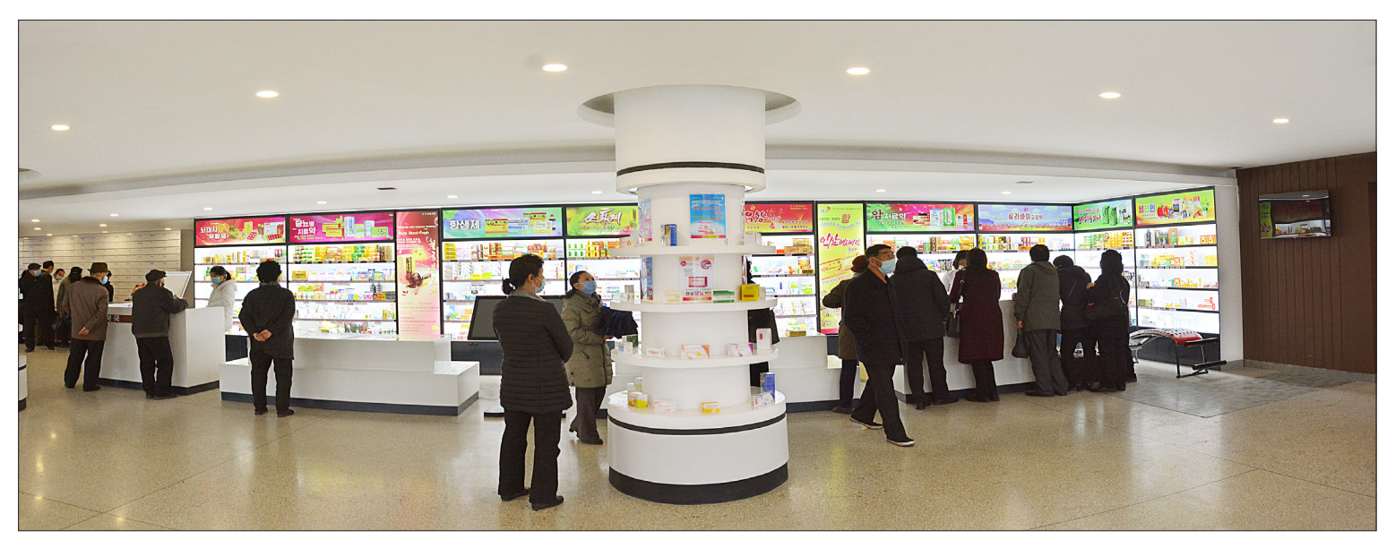
A glimpse of the general pharmacy under the Moranbong District medical supplies management station.

"The days of your military service and feats dedicated to the country and all of us cannot be compared with 500-odd days we spent for your treatment. It is the natural duty and moral obligation of medical workers to restore honoured disabled soldiers to health," Nam Kwang Hyok told the patient.