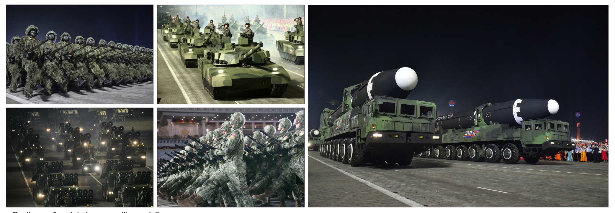
The Korean People's Army, an elite revolutionary army.

The parade involved the columns of the latest tactical missiles with great manoeuvrability and annihilating striking power, mainstay tanks, artillery pieces, anti-aircraft missiles, extra-large ICBM Hwasongpho-17 horrifying the imperialist enemies and other strategic missiles and new advanced weapon systems and the formations of fighters decorating the sky with dazzling fireworks. The stormy cheers of hurrah going up from the columns of elite units marching in a fine array holding the colours of feats with the pride of having defeated the US imperialists who had boasted of being the "strongest" in the world by inheriting the anti-Japanese tradition rocked heaven and earth with the will of the Korean people to emerge victorious forever under the leadership of the respected Comrade Kim Jong Un.