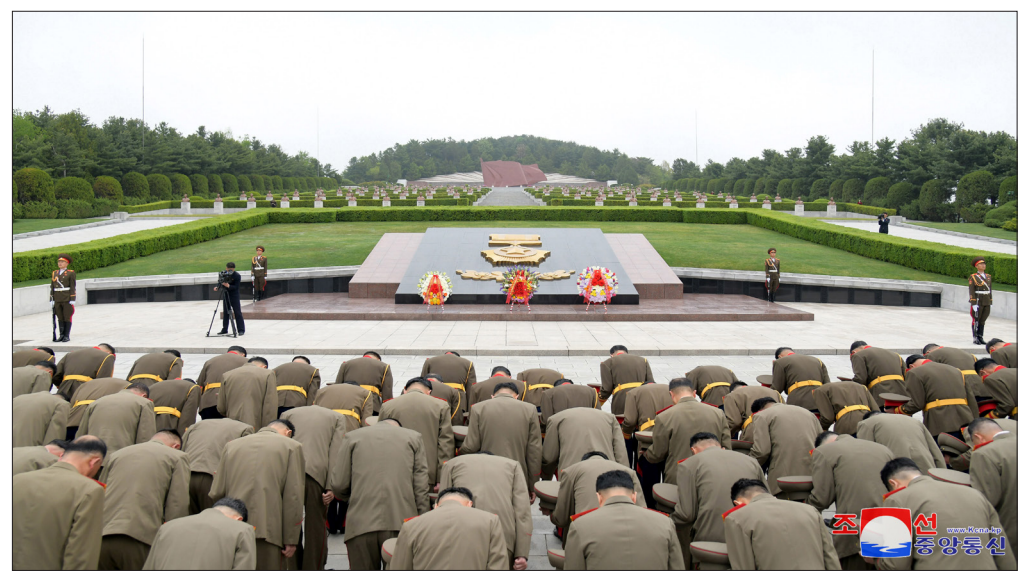
Officers and men of the Korean People's Army visit the Revolutionary Martyrs Cemetery on Mt Taesong to pay homage to the anti-Japanese revolutionary fighters on April 25.