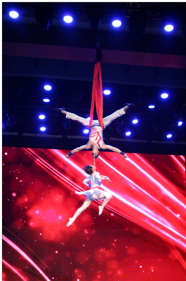
Lao National Circus.