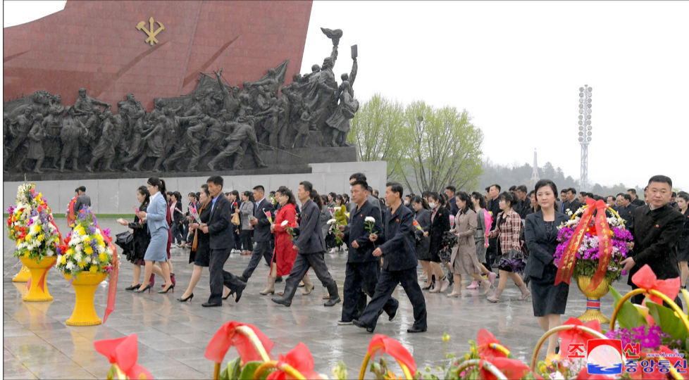
People from all walks of life pay floral tributes to President Kim Il Sung and Chairman Kim Jong Il on Mansu Hill on April 15.

Students of revolutionary schools, pupils of primary schools and other children across the country received gifts associated with benevolent love of the