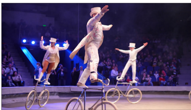
Circus of State Acrobatic Company of Russia.