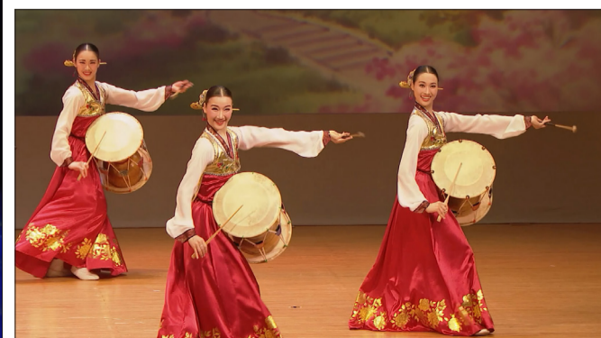
Art Troupe of Koreans Resident in Japan.