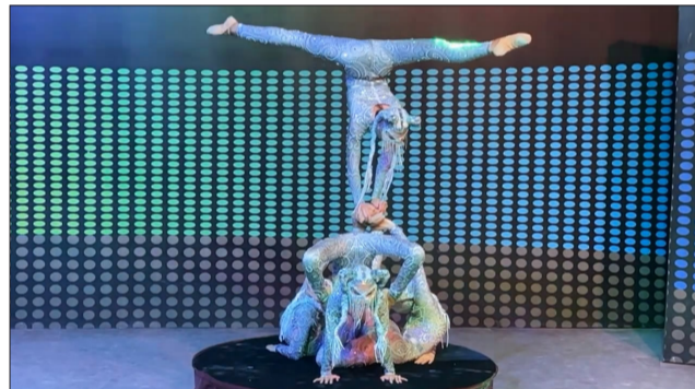
Ulan Bator Circus of Mongolia.