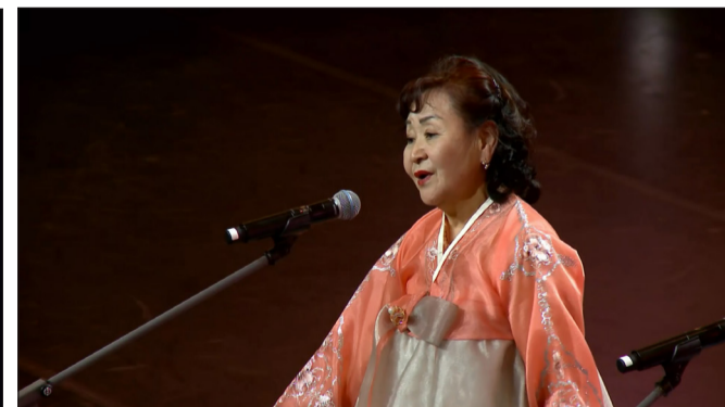
A Korean singer resident in Russia.