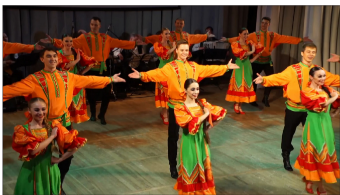
Russian Dance Ensemble "OGONKI" of the Altai Territory Philharmonic.