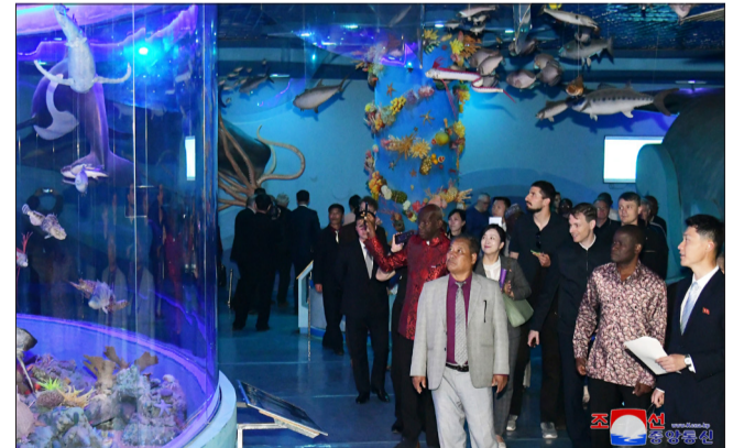
Delegations and delegates of organizations for the study of the Juche idea look round the Natural History Museum.

They also visited the National Gifts Exhibition House, the Kangdong Greenhouse Complex, the Korean Art Gallery and other places and enjoyed a concert given by the National Symphony Orchestra.