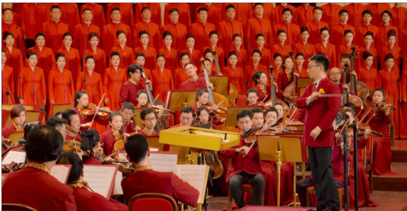
Chinese Art Group.