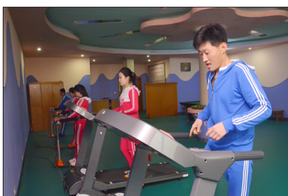
Workers have a good time enjoying various services at the Kangson Health Complex.