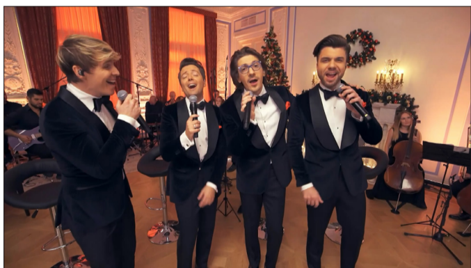
Vocal band "KVATRO" of Russia.