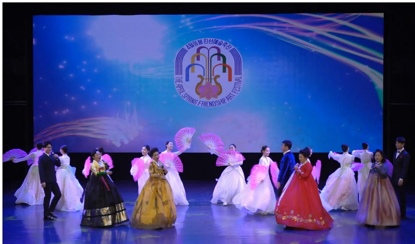
Art Troupe of Koreans Resident in China.