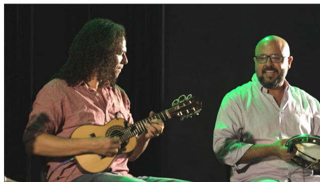
Group Choro Livre of Brazil.