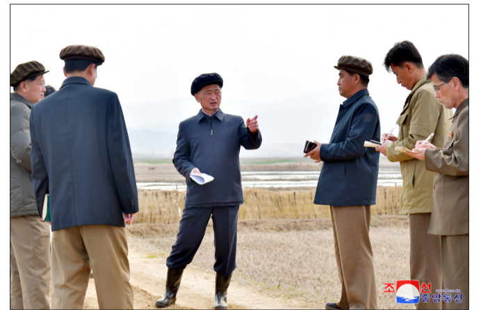
Premier Kim Tok Hun (fourth from right) inspects the Kumsan Farm in Unnyul County.

Meanwhile, the premier visited the construction sites of regional-industry factories in Jaeryong and Unchon counties. He encouraged the soldier-builders who are pushing ahead with the projects as scheduled, while ensuring the speed