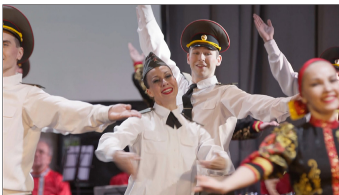
The State Dance Ensemble "Ural" of the OGBUK "Chelyabinsk Philharmonic Society" of Russia.