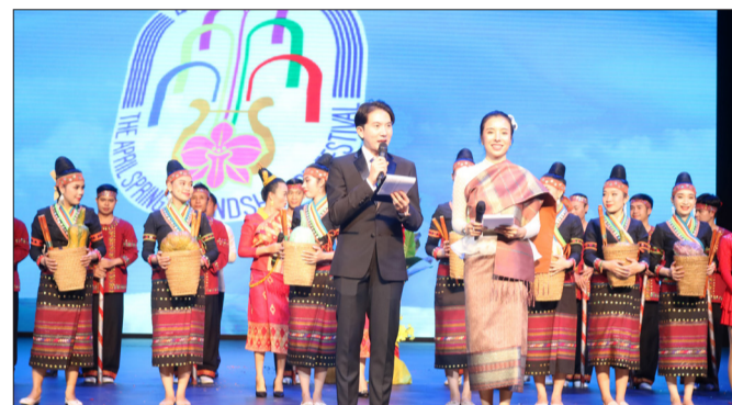
Lao National Art Troupe.