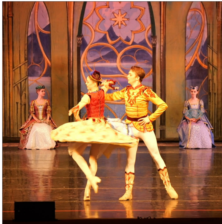
Classical Ballet Troupe of the Belarus State Academic Musical Theatre.