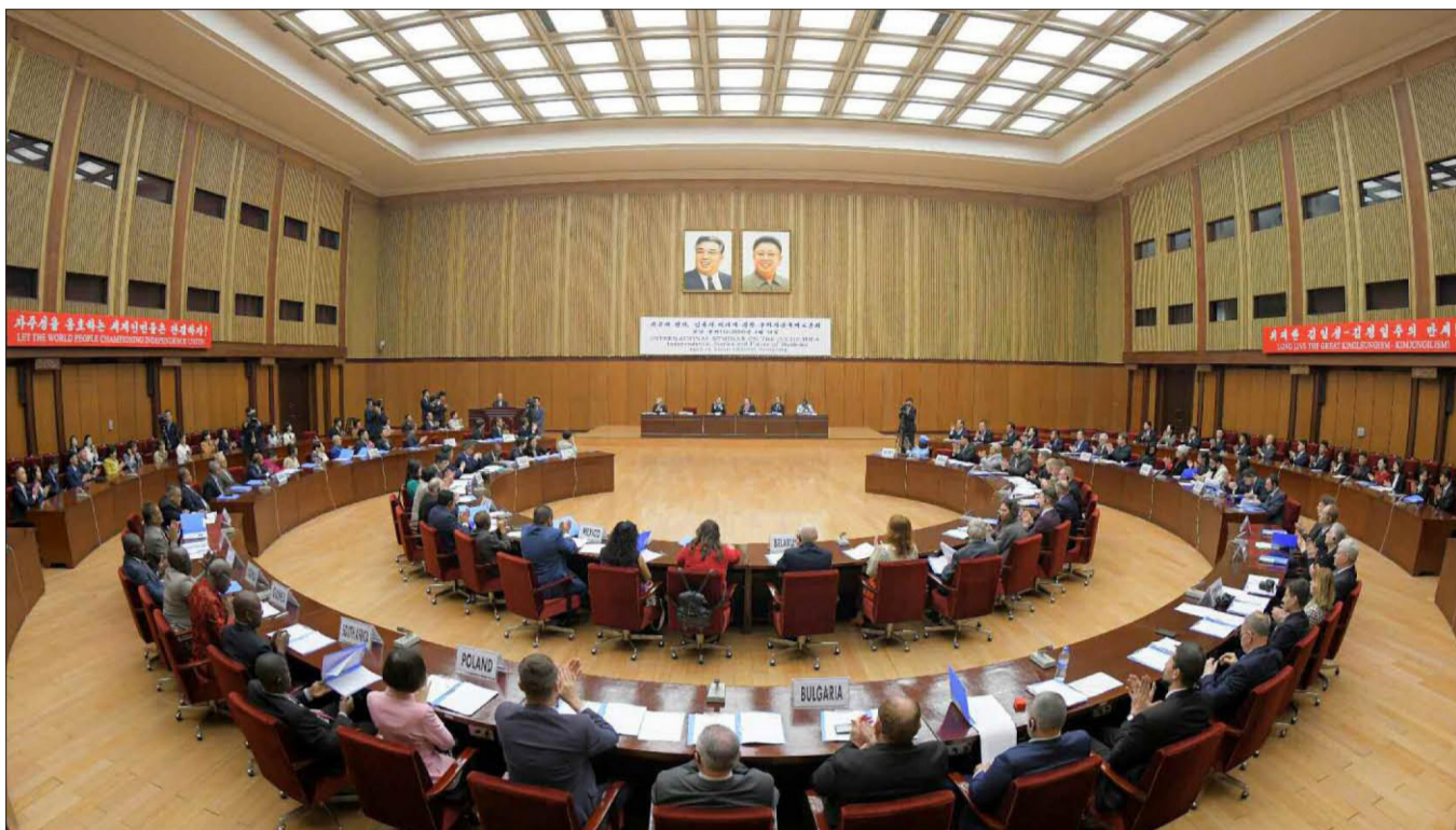
An international seminar on the Juche idea for independence, justice and future of mankind takes place in Pyongyang under the co-sponsorship of the International Institute of the Juche Idea and the Korean Association of Social Scientists on April 14.