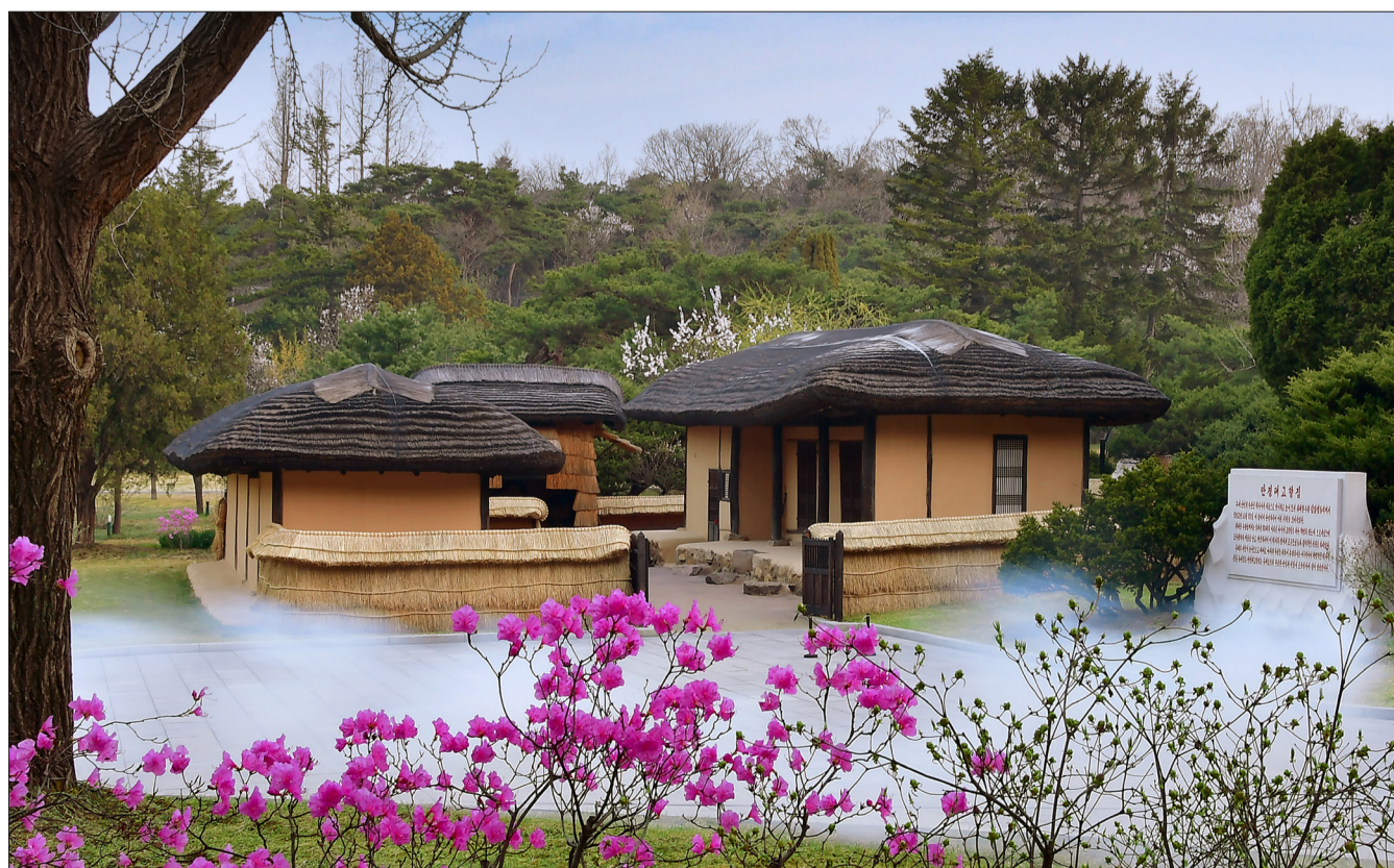
Birthplace of President Kim Il Sung at Mangyongdae.

"I have never been to the roof when I looked round the factory. The respected Comrade Kim Il Sung is really a great man," the president of the country said with deep emotion after hearing the impressive news about his love for the people.