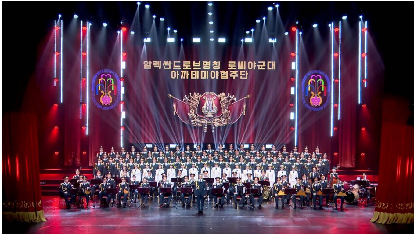
The Alexandrov Academic Ensemble of Song and Dance of the Russian Army.

The 33rd April Spring Friendship Art Festival takes place in Pyongyang from April 11 to 25. The festival brought together many state-level art organizations, renowned art troupes, artistes and overseas Koreans from more than 20 countries.