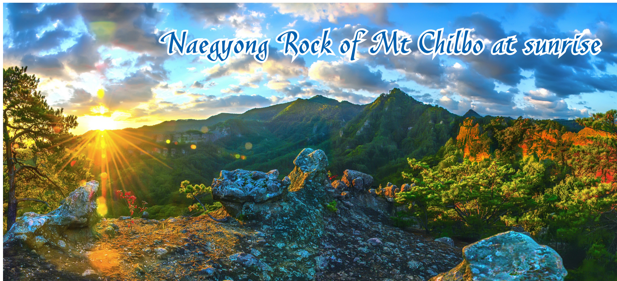
The sun rises over Mt Chilbo, a scenic attraction on the east coast of the DPRK.