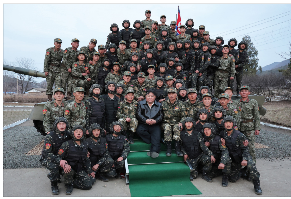
FROM PAGE 1

for the development of the sacred and proud unit, Kim Jong Un recollected with deep emotion the proud course of the guards tank unit that has followed the road of loyalty as invincible iron-clad ranks shining with victory and glory.