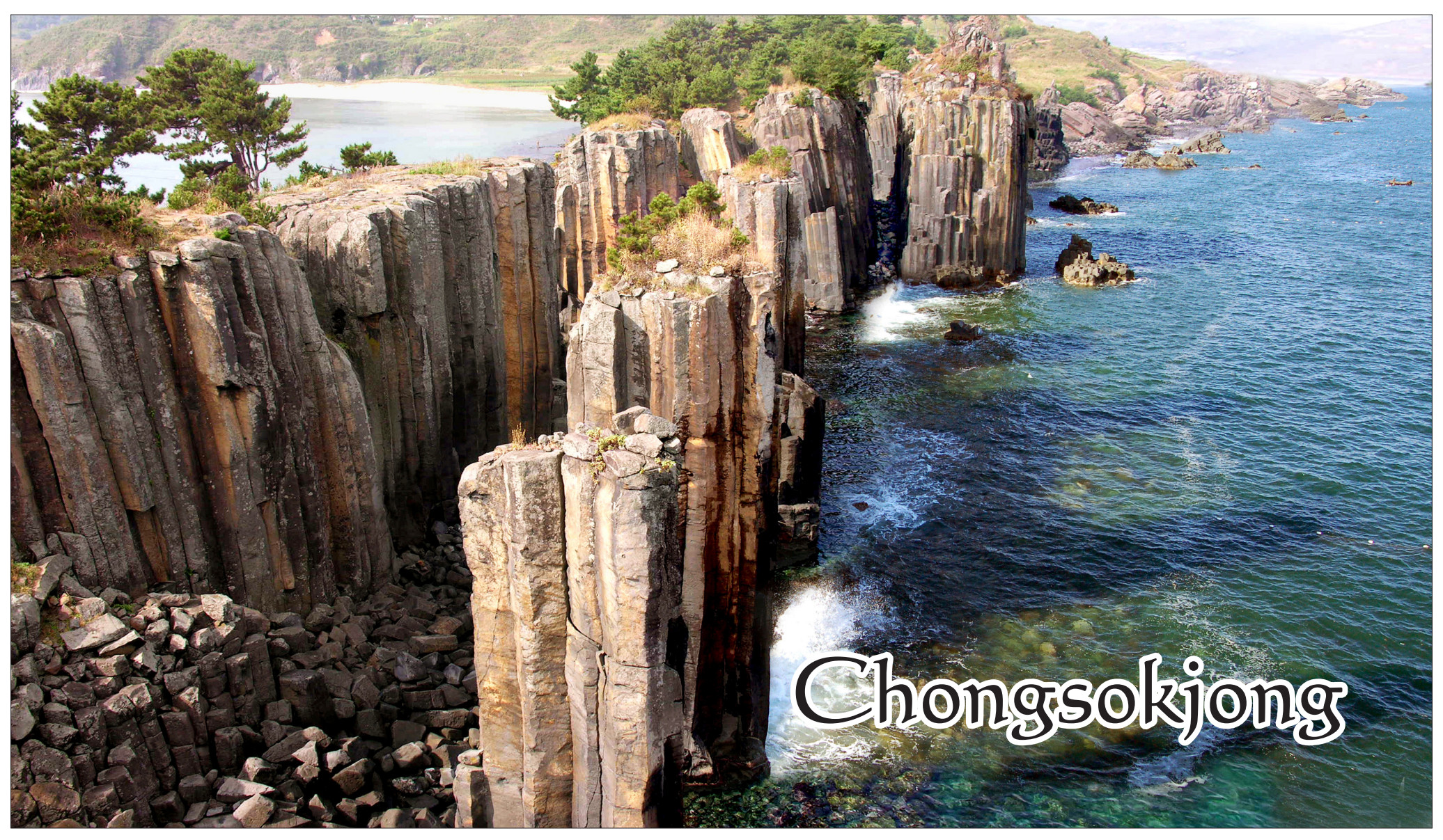
Chongsokjong at the seaside of Thongchon county town in Kangwon Province has been called one of the eight scenes in the Kwandong area since olden times.