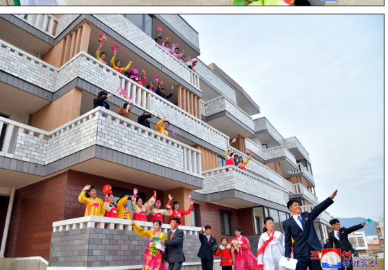
A meeting for moving into new houses takes place at the Kangdong Greenhouse Complex on March 27.