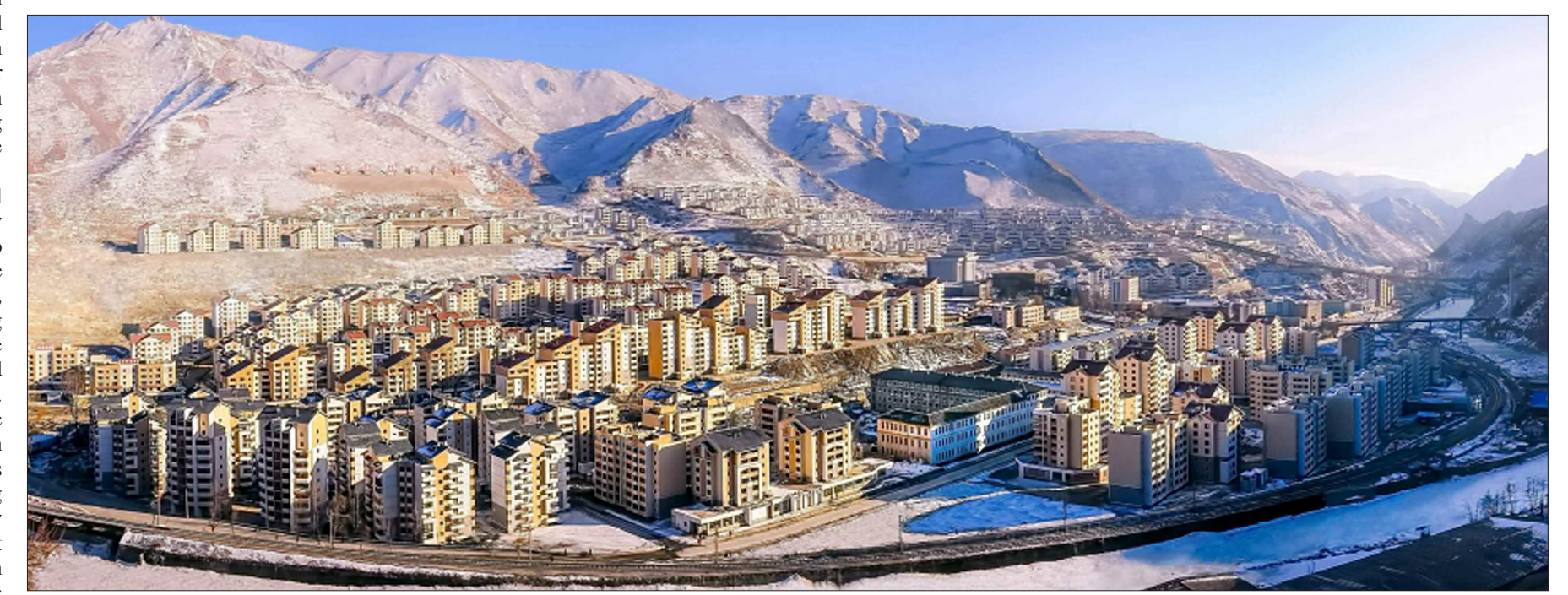
A bird's-eye view of the mountain-gorge city built in the Komdok area.

Every inhabitant in Komdok is determined to repay the favour of the country which provided ordinary miners with many new flats free of charge with increased mineral production.