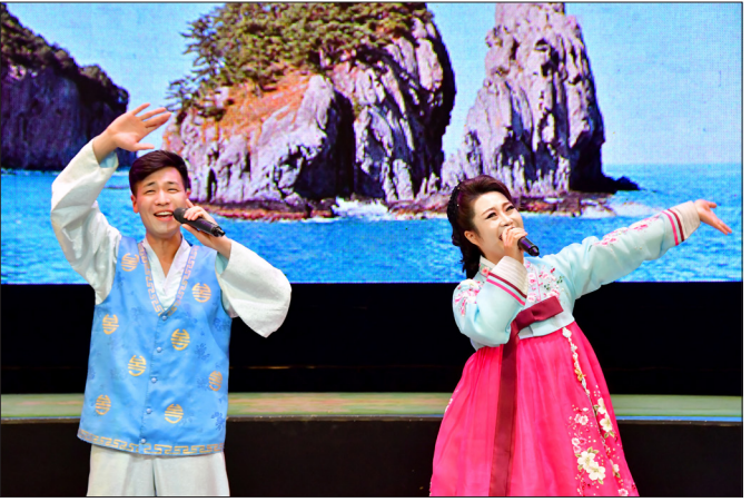
The National Acrobatic Troupe and the National Folk Art Troupe give a performance at the Pyongyang Circus

be claimed to be the climax of the work, the audience applaud enthusiastically as they are lost in admiration.