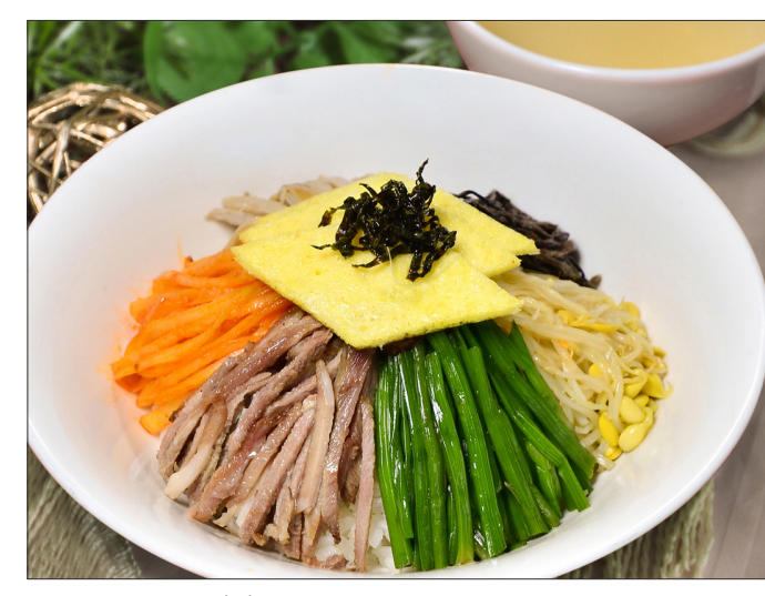
Pyongyang pibimpap, boiled rice with assorted mixtures.

In Korea in the past, dozens of public and family ceremonies took place annually, including wedding, memorial service and dinner parties held on holidays and the 24 seasonal divisions of the year by the lunar calendar. On those days, people would prepare various dishes and shared