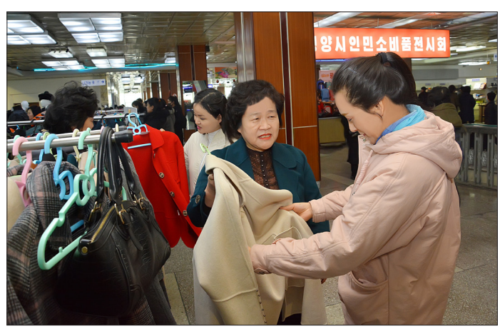
Visitors admire the goods on show at the Pyongyang Municipal Consumer Goods Exhibition.