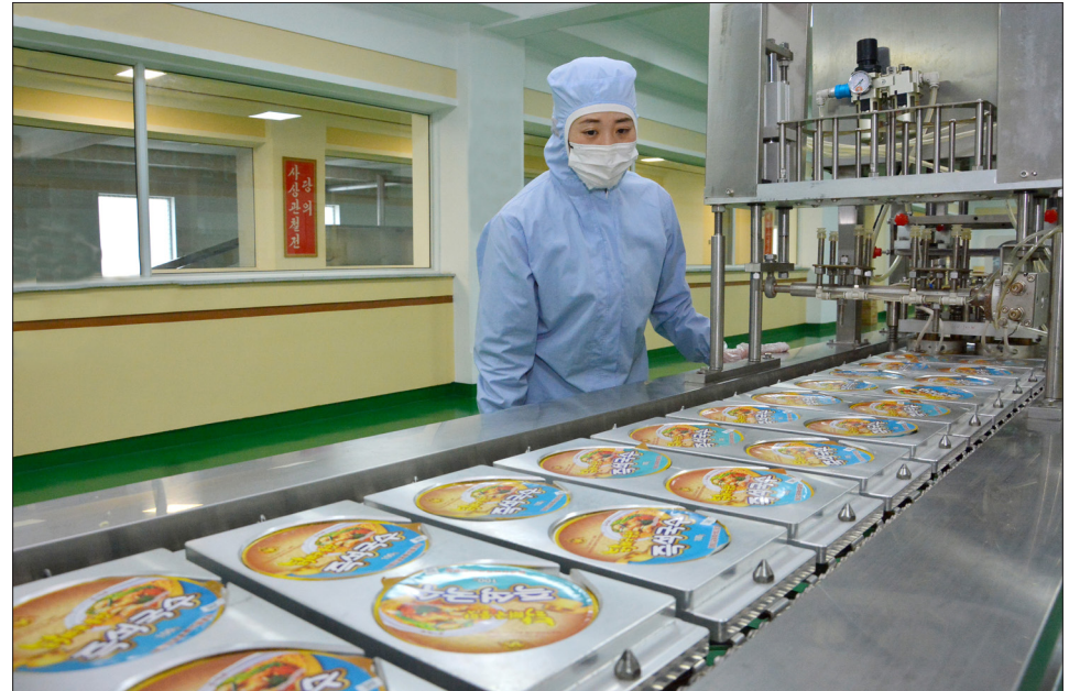
Instant noodles are produced at the Taedonggang Kumok Instant Rice Factory.

setting a reasonable rate of eating warm rice and soup. composition of condiments to remove its unpleasant taste.