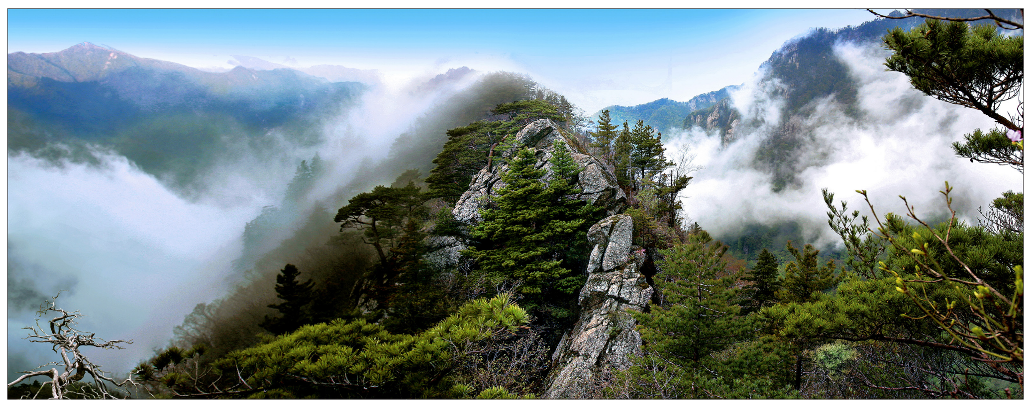
Hyangbiro Peak in Mt Myohyang is covered in mist.