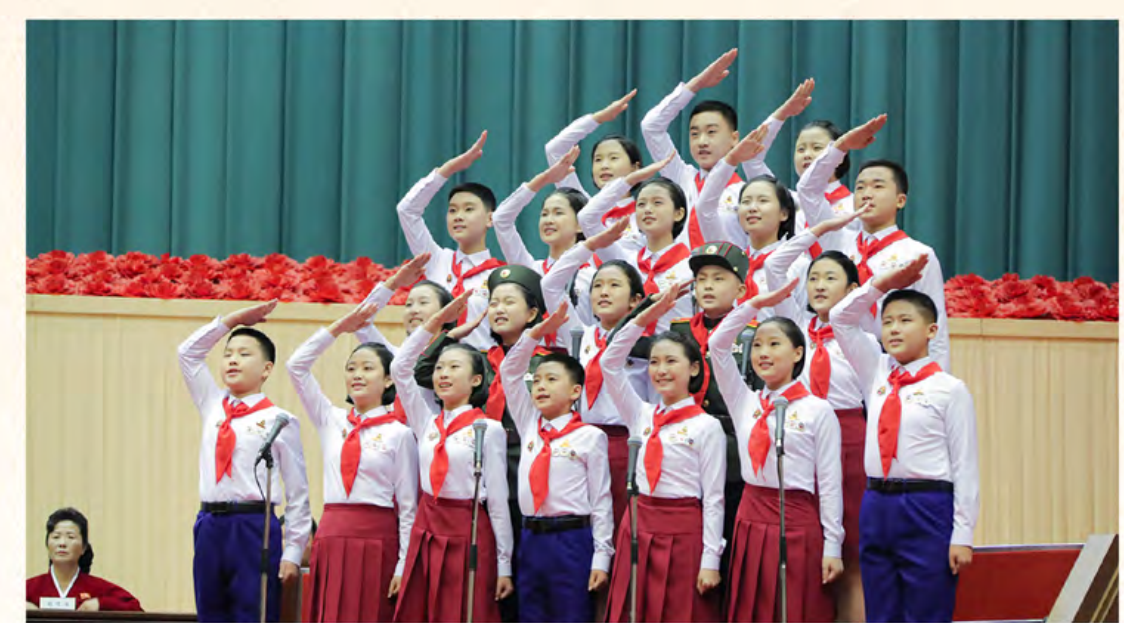
The congratulatory group of the Korean Children's Union reciting a congratulatory poem "We extend glory to the great mother"

socialist construction and a changed ideal society to come in near future.