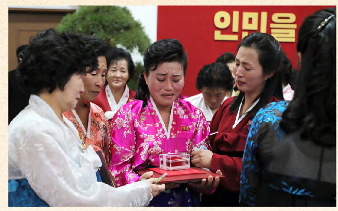
The newly-enacted Communist Mother Honour Prize awarded to the women who have made distinguished contributions to the prosperity of the country