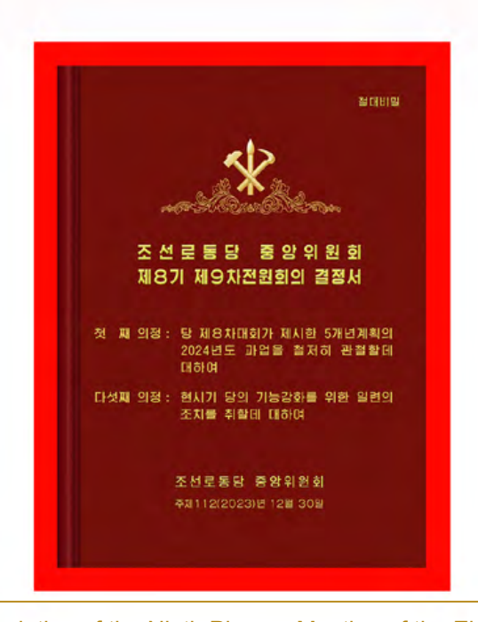
Resolution of the Ninth Plenary Meeting of the Eighth Central Committee of the Workers' Party of Korea

The Ninth Enlarged Plenary Meeting of the Eighth Central Committee of the Workers' Party of Korea takes place at the office building of the Central Committee of the WPK from December 26-30, Juche 112 (2023).